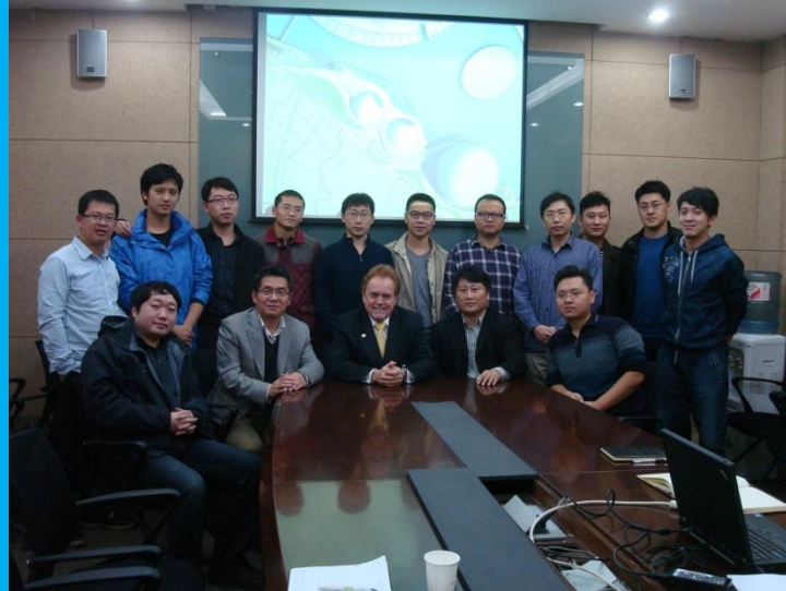
The Team of Engineers, Architects and Designers that designed the Preliminary sketches of the Penglai Twin Domes & Mall Project