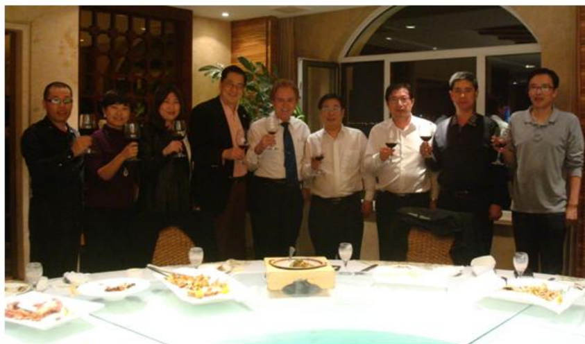
Fourth from left